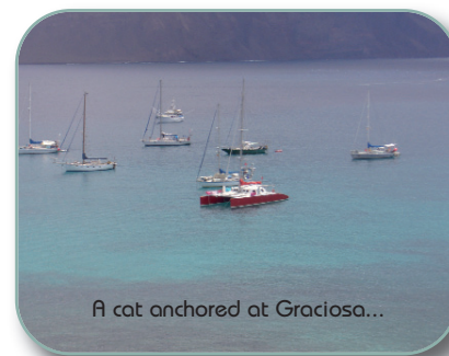
A cat anchored at Graciosa...

Graciosa is an island the size of Groix, with a village of 500 inhabitants and a lovely little port, in which your catamaran will be perfectly sheltered.