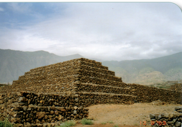
Aztec pyramids? No, this one is in the Canaries!

Graciosa... One of the stops you will not forget.